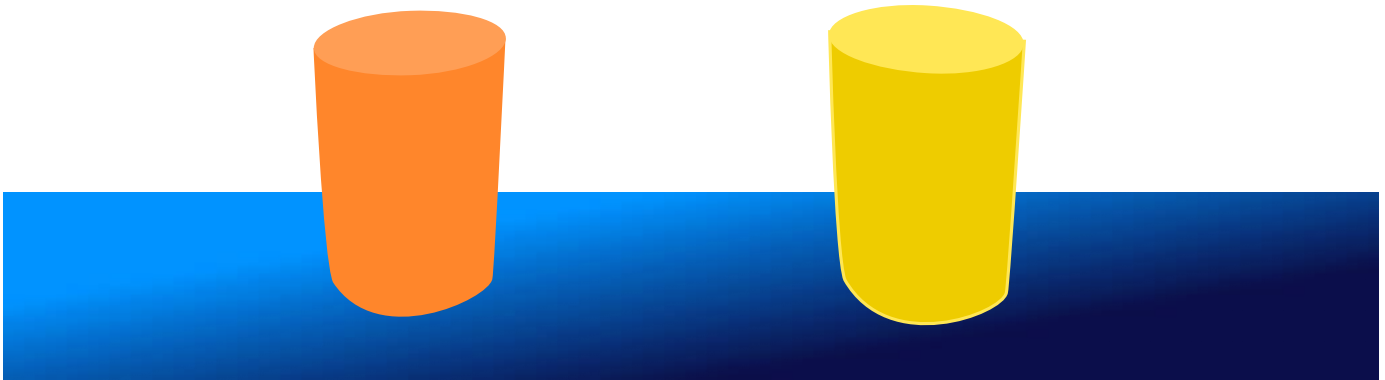
Oscar - "O" Inflatable Cylinder